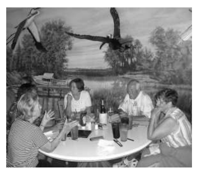
They came from the south...