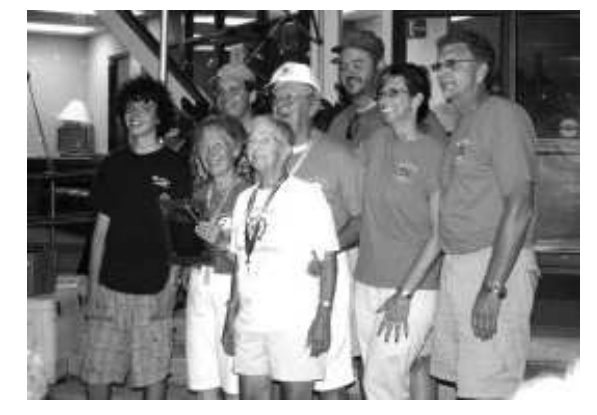
Rat Ark crew