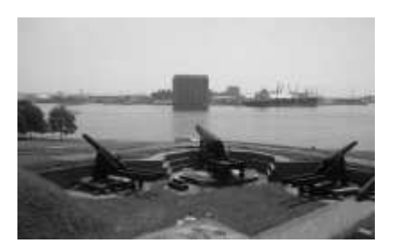
Protecting Baltimore's inner harbor