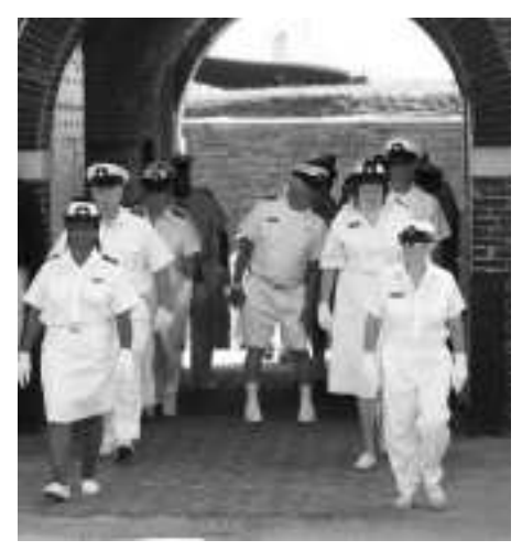
The Honor Guard enters Ft. McHenry