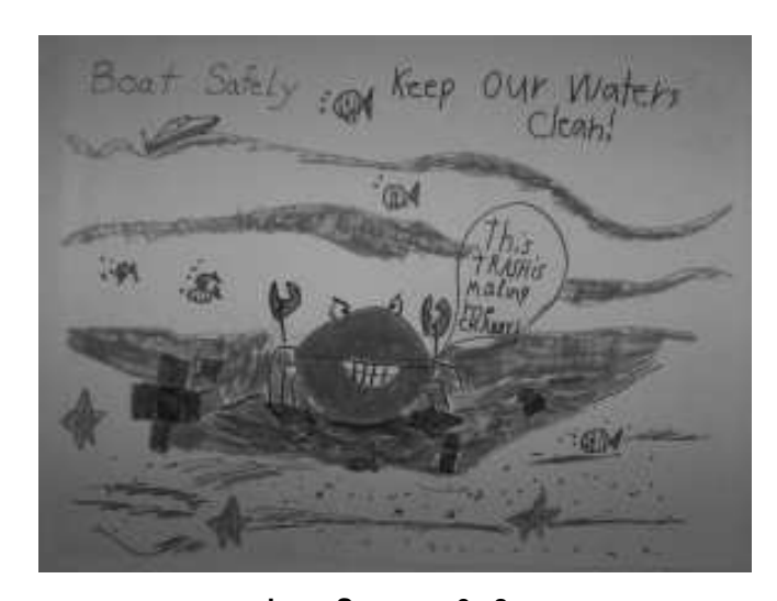
Lane Sweaney 6 - 8