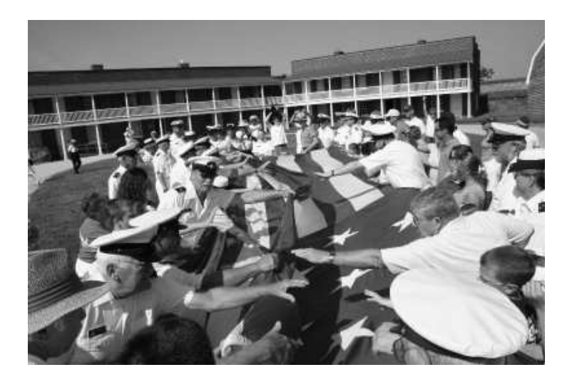
Squadron members helped unfold the storm flag