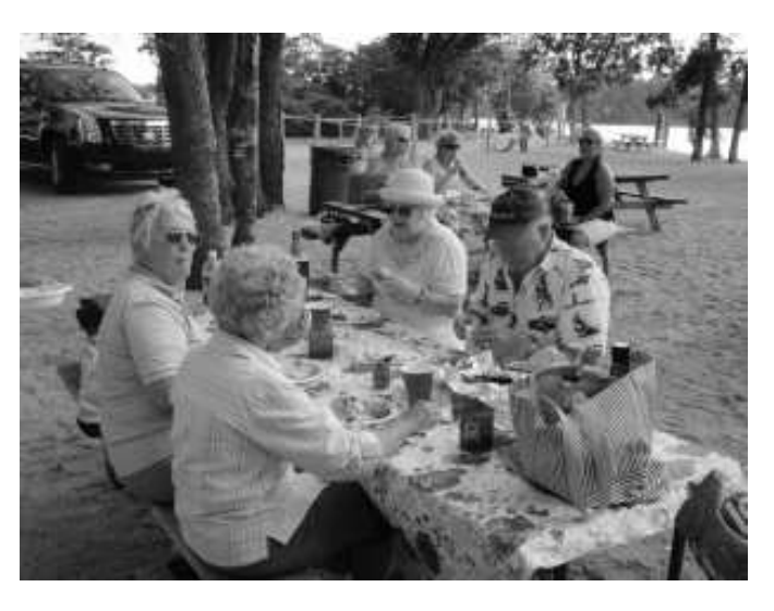
and they came from the north.